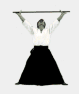
as a symbol for myself, as a symbol of the Unknown,